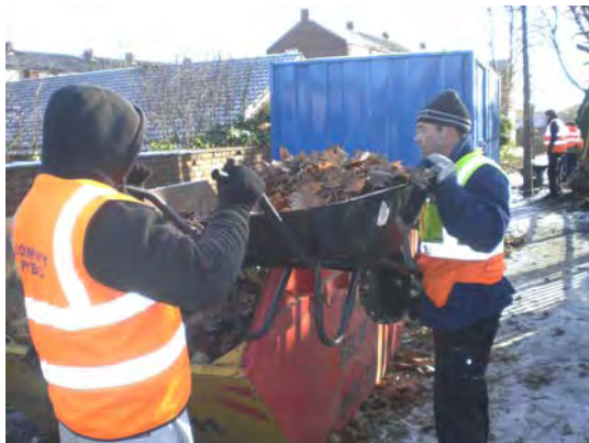
Offenders working on Salford SNAPS project

Former home secretary Alan Johnson visited the site earlier in the year on the run up to the General Election.